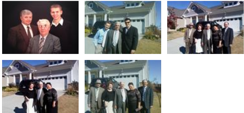
Yaroslav Didovets - January 28, 2014 at 11:05 PM

“ 7 files added to the album Memories Album